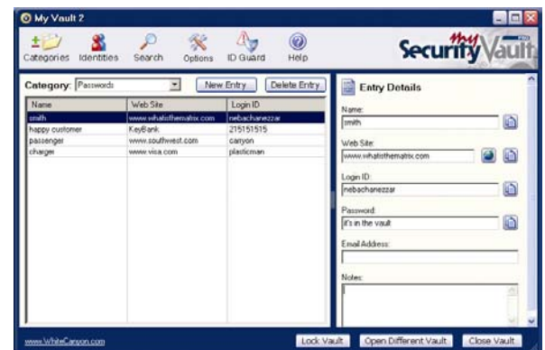
MySecurityVault's easy-to-use intuitive interface with built-in tutorial.